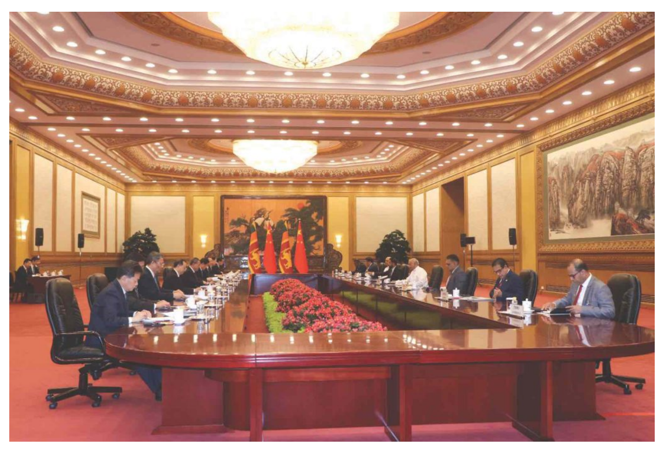
Prime Minister Dinesh Gunawardena and Chinese Prime Minister Li Qiang in discussion with other delegates.

problems. PM Dinesh Gunawardena thanked the Chinese government for their support and acknowledged that he and his family continuously worked for strengthening friendship between China and Sri Lanka.