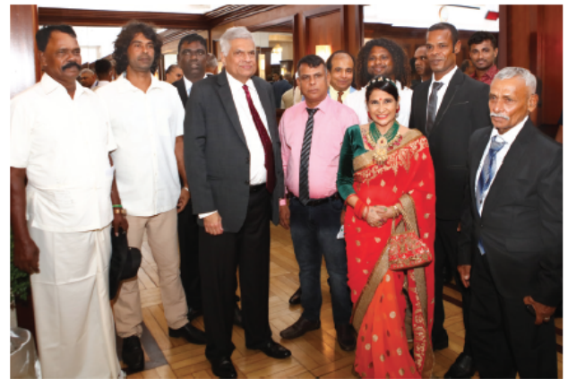
President Ranil Wickremesinghe with Paper Moon Kudils, Arugambay Roccas, Peanut Farm, Upali Beach Surf Resort and Mambo's Arugambay.