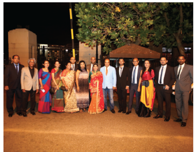
BT Options staff.