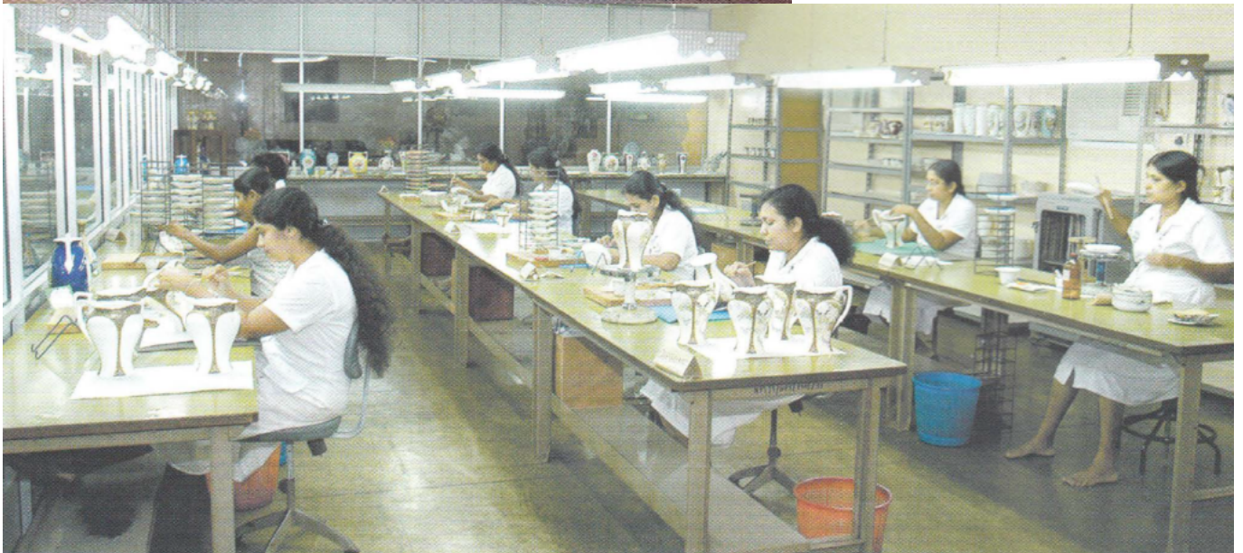
The Pannala workshop