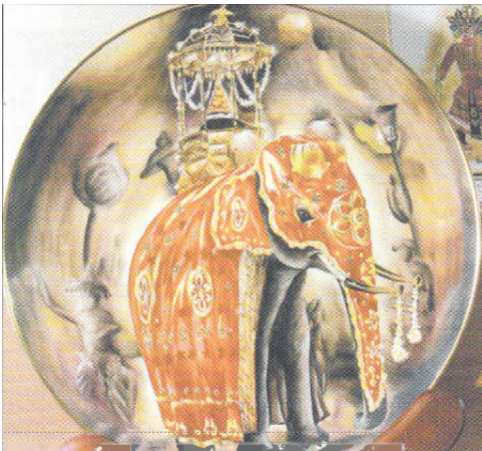
A gift plaque handpainted with an elephant in Perahera.