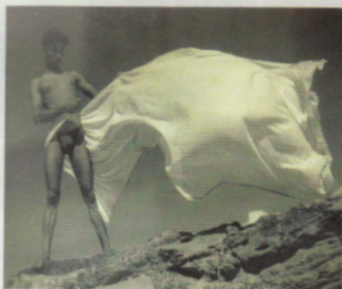
LIONEL WENDT, 1930 (23"x9.5") black & white photographs