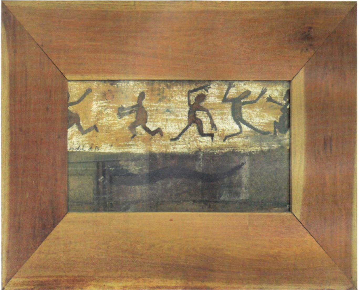
SASKIA PRINGERS Untitled 1994 (26"x18") oil on collage