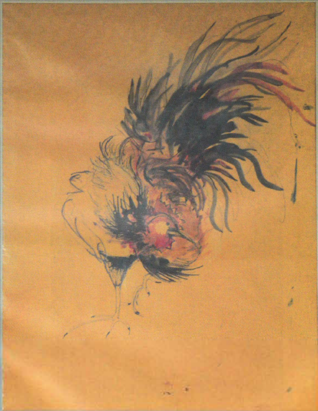
ISMETH RAHEEM, Untitled (22.5"x18") water colour