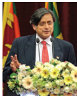
Dr Shashi Tharoor, Indian MP (Lok Sabha)