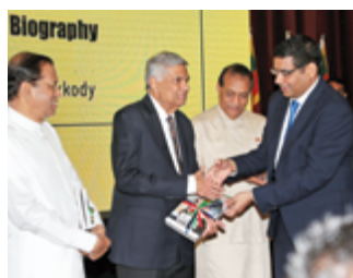
Dinesh Weerakkody presenting a copy of the book to Prime Minister Ranil Wickremesinghe

'R anil Wickremesinghe – A Political Biography' by Dinesh Weerakkody, follows the political journey and character of a leader dedicated to the progress of Sri Lanka.