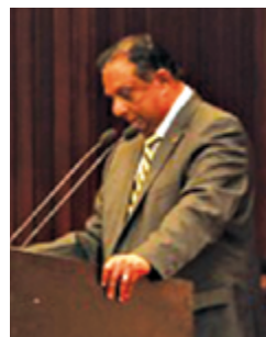
Minister John Amararatunga