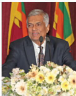
Ranil Wickremesinghe, Prime Minister of Sri Lanka