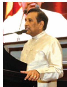
Minister Rajitha Senarathne